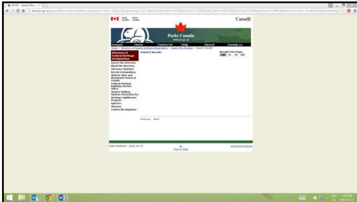
Image 4: Aamjiwnaang First Nation Search Results (Parks Canada 2012)